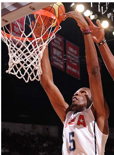
Kevin Durant, the NBA's leading scorer in 2009-10, headlines a list of 15 players who USA Basketball announced today as finalists for the 2010 USA World Championship Team.

The Festival concludes Sunday, Aug. 15, when the USA squad takes on France at Madison Square Garden, 1 p.m. (EDT), in the first game of an exhibition doubleheader. China will meet Puerto Rico at 3:30 p.m. (EDT) in